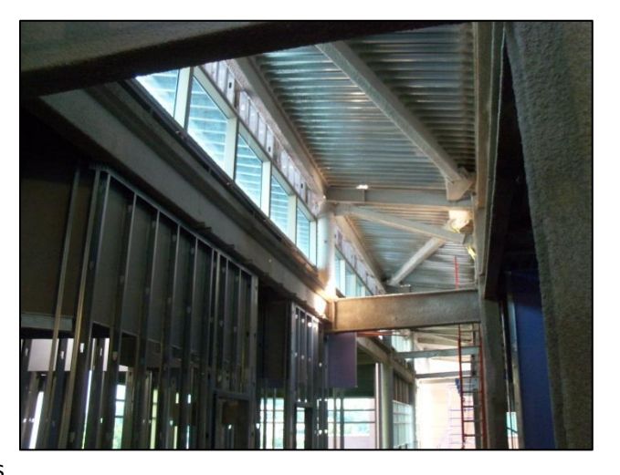
Figure 3 Shown above is the clerestory that stretches over 200 feet long and bringing in natural light.

There will also be a drainage pond located between the Area C and the existing south wing. The pond will manage